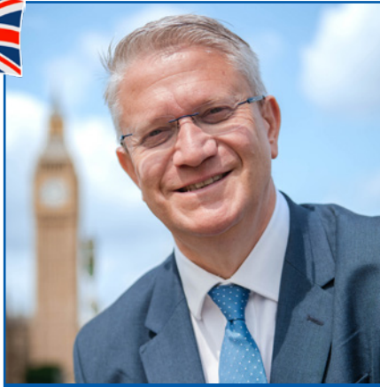
Andrew Rosindell M.P. Member of Parliament for Romford

2024 will be turning point for the United Kingdom and for Romford. The General and London Elections will shape our Nation and Capital for years to come.